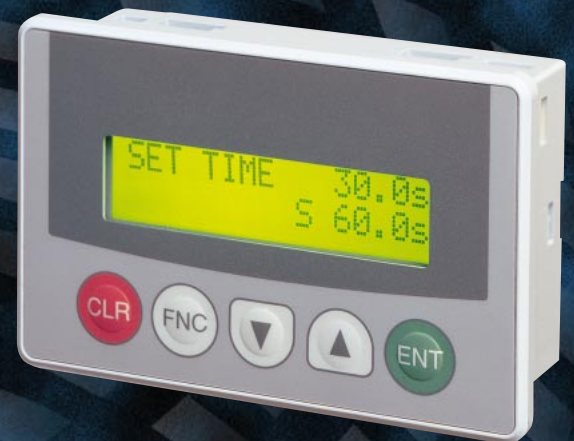
Control Panel Attachment FX-10DM-E

The operating panel of the FX-10DM-E has a dustproof surface and waterproof tested to IP65F specifications.